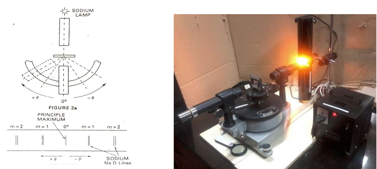
Figure 2: Schematic for diffraction of sodium Na-D lines

The actual experimental set up is shown in Fig. 3.